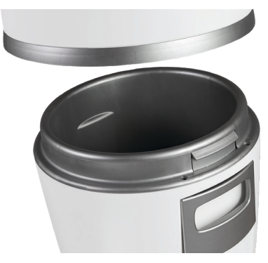
A large and spacious dust canister with a quick fastening function