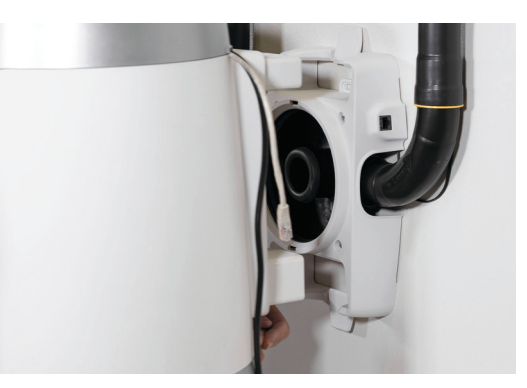
Revolutionary wall bracket fastening

The detail-oriented design is seen, for example, in the easy way of emptying the dust canister. The sturdy handles and the 360° installation of the canister make it easy to empty the canister. (Z series models)